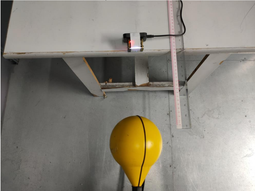
Top Position E