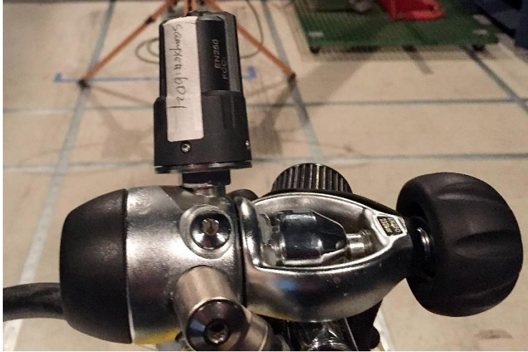
View of Installed on Tank