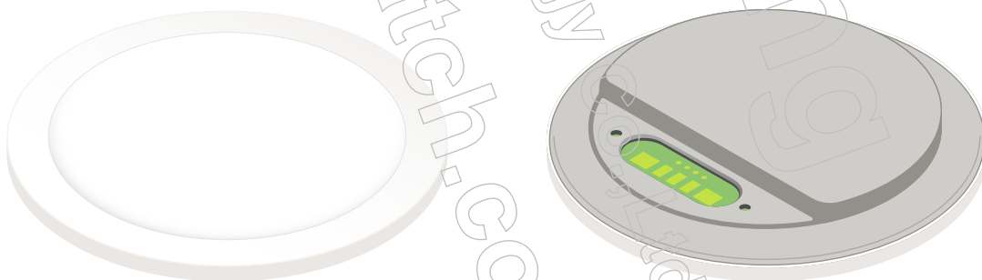
Figure 70-1 MagSafe Charger Module (C222)

Examples of accessories benefiting from the increased attach force of the MagSafe Charger Module (C223) include vent mounted chargers, battery packs, and tripod mounts.