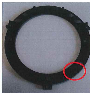
No DRL version Mod.ZDM1604-F-00