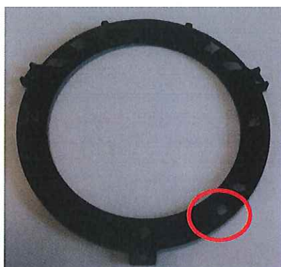
DRL version Mod.ZDM1604-D-00

The difference between versions ZDM1604-D-00 and ZDM1604-F-00 is related only to the ring light silk-screen. In the model ZDM1604-F-00 (no DRL version) the corresponding light (LED) will not be silk-screened. This difference is only mechanical and does not affect the RF function