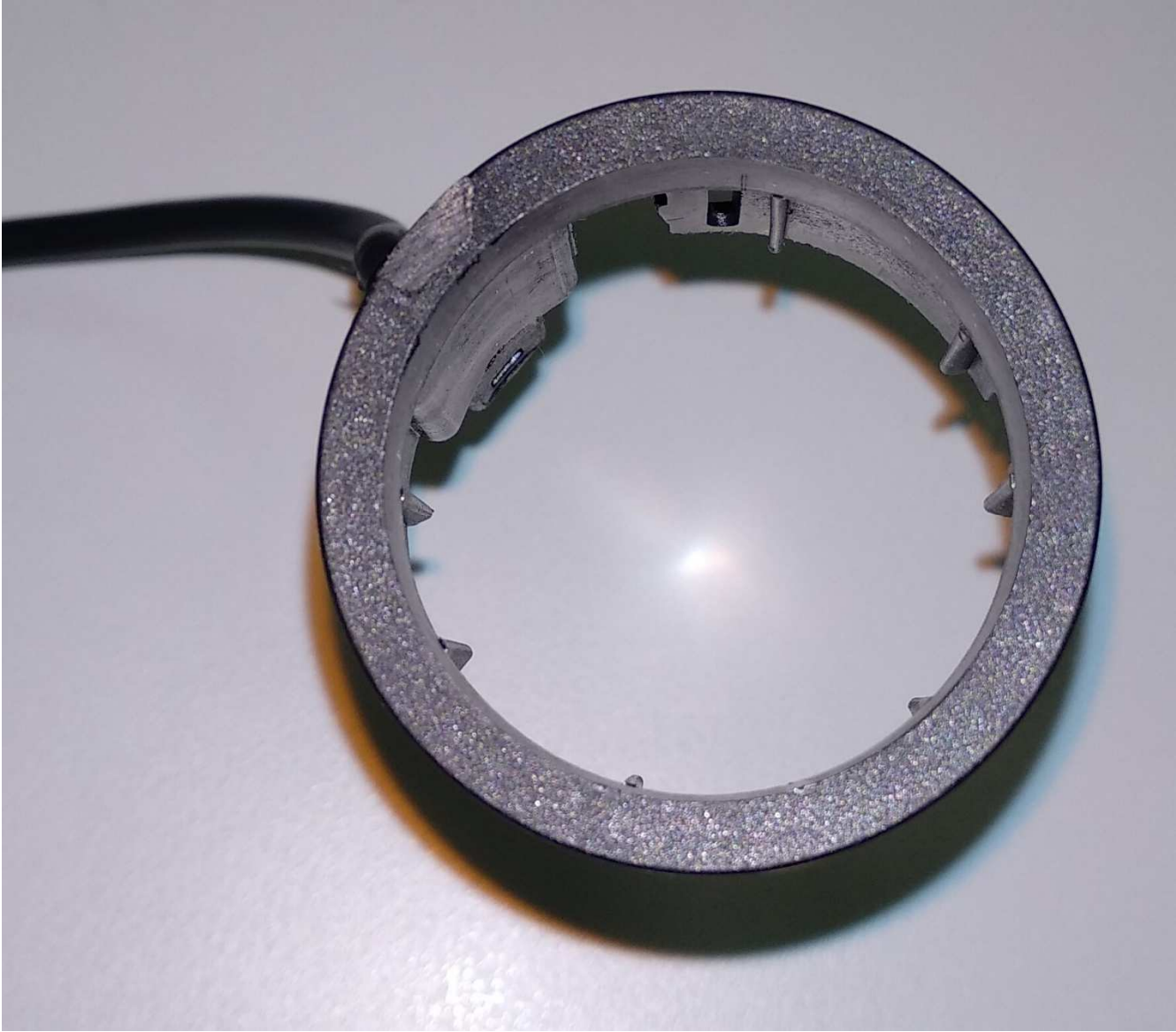
Antenna (bottom side)