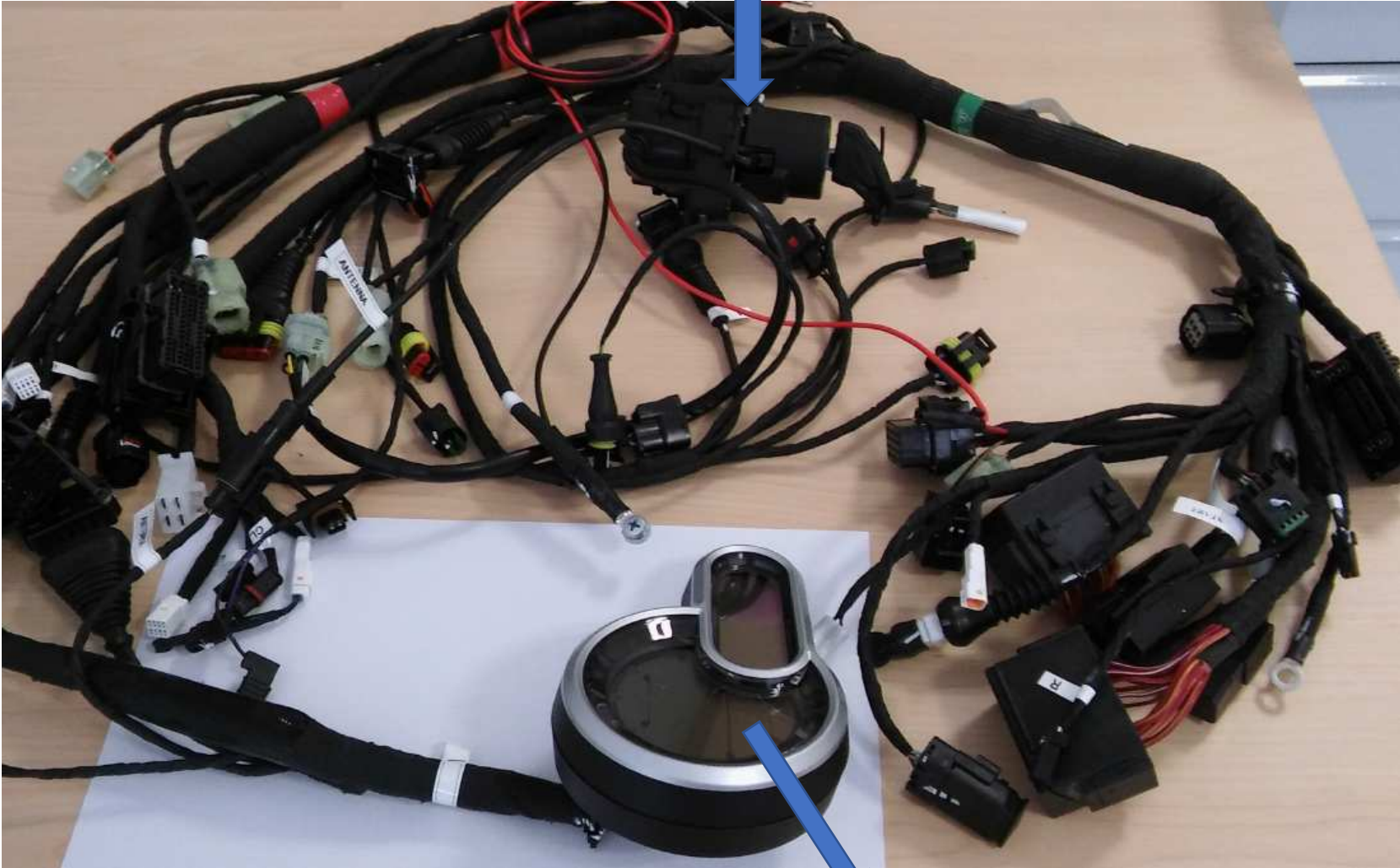
View dashboard+cabling+ ignition switch containing antenna