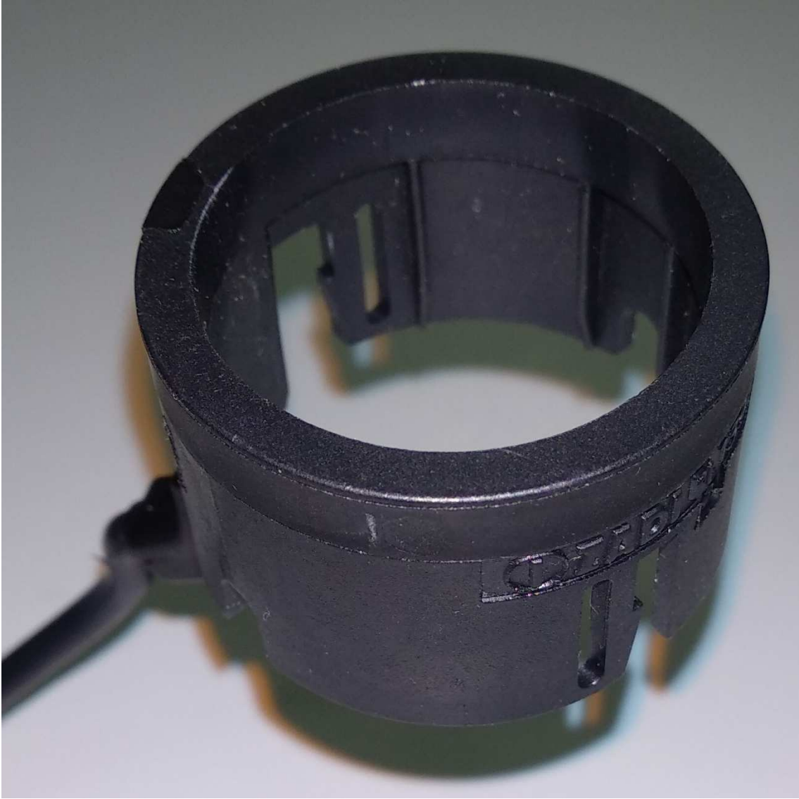
Antenna (upper side)