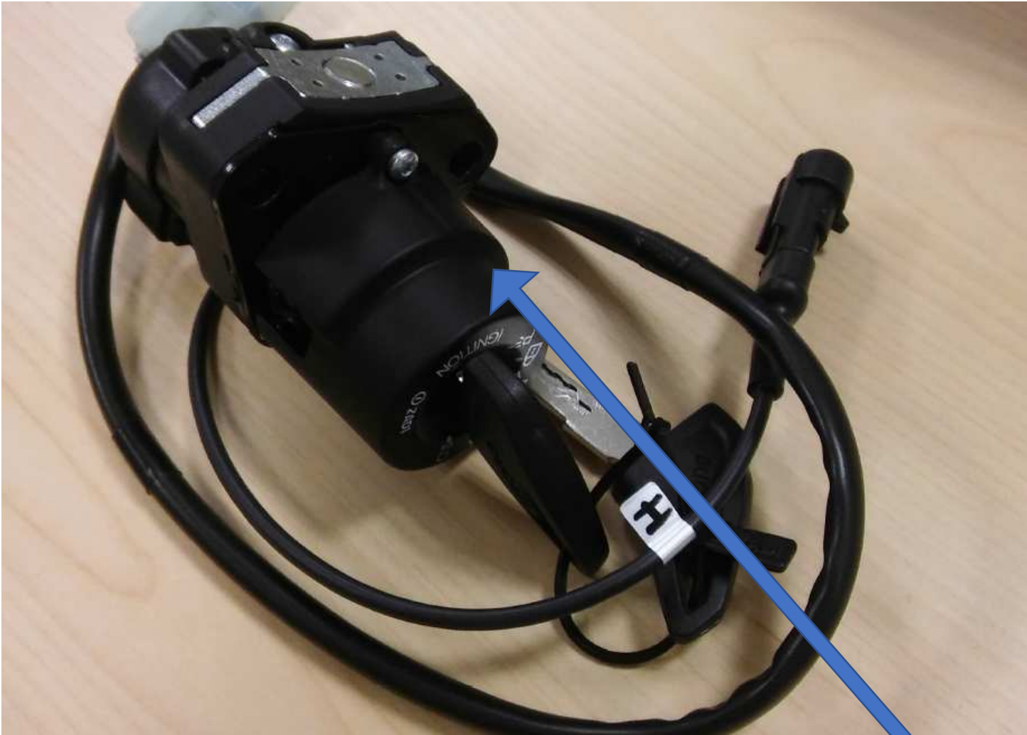
Ignition switch containing antenna (and position of antenna)