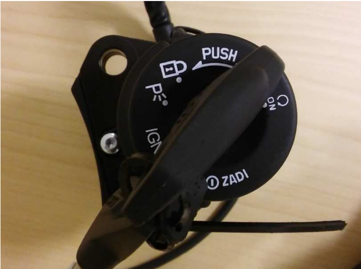
Ignition switch containing antenna (upper view)