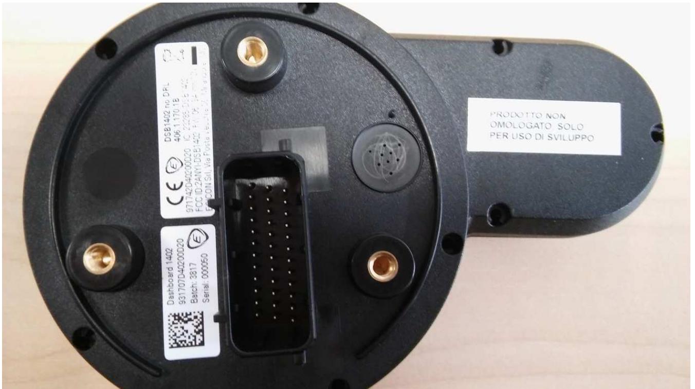
Back DSB1402 no DRL and labelling position