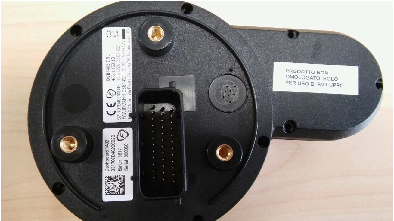
Back DSB1402 DRL and labelling position