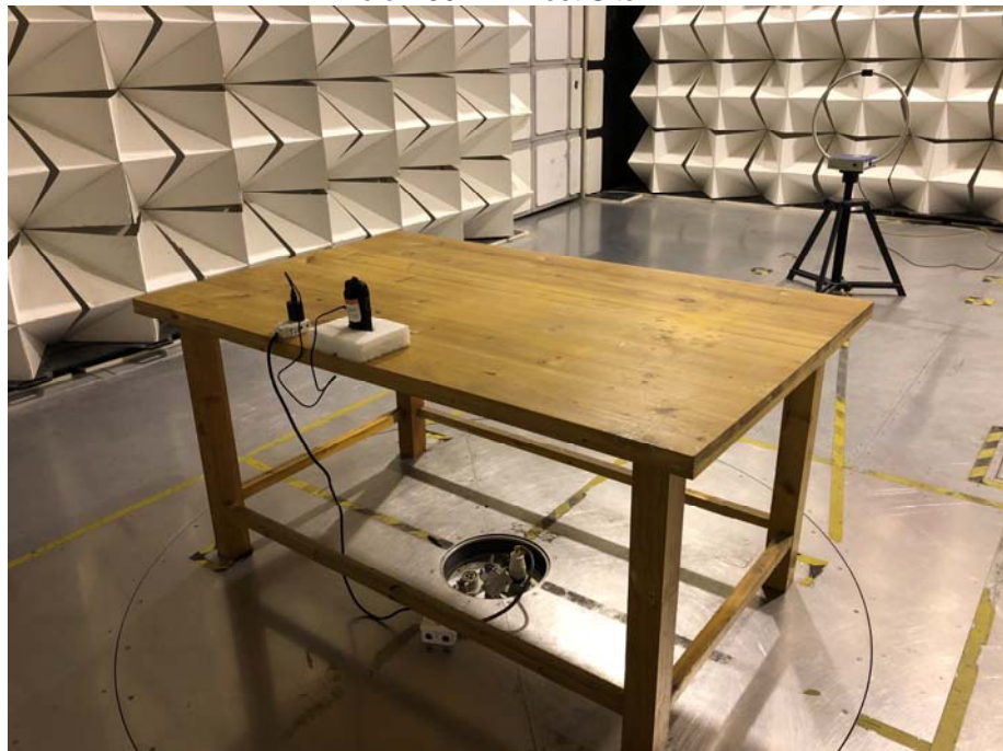
Below 30MHz Test Site 2#