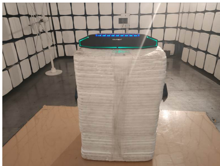
Test Setup for Radiated Emissions(Above 1GHz)