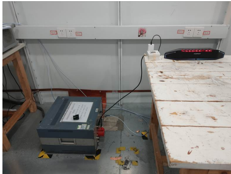
Test Setup for Power Line Conducted Emissions