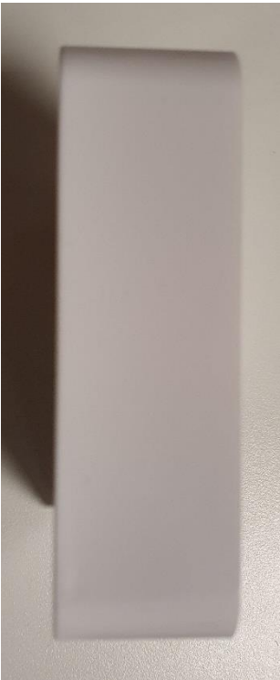
ERS Display series left side