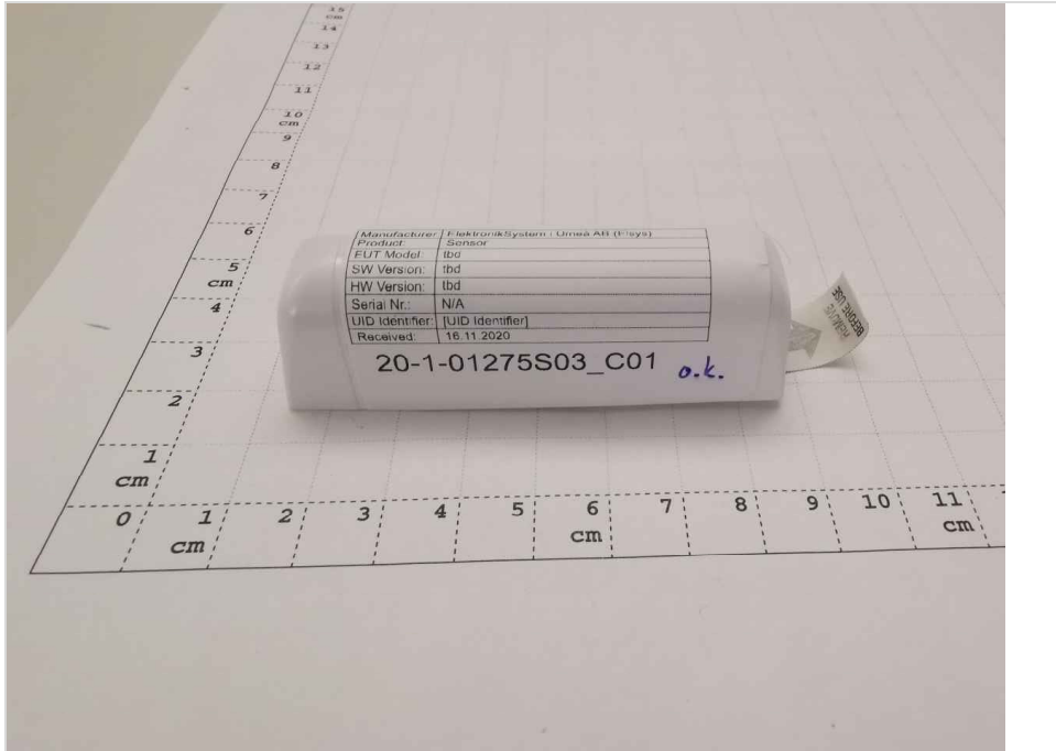
Photograph 1: EUT Top view