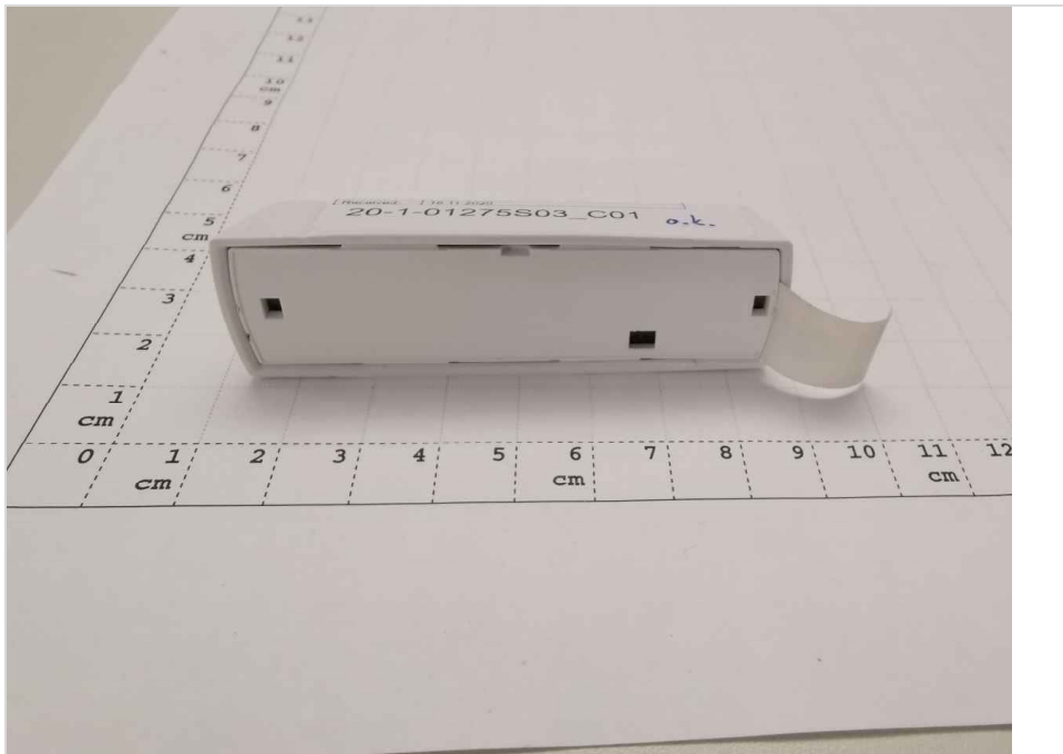
Photograph 2: EUT Bottom side view