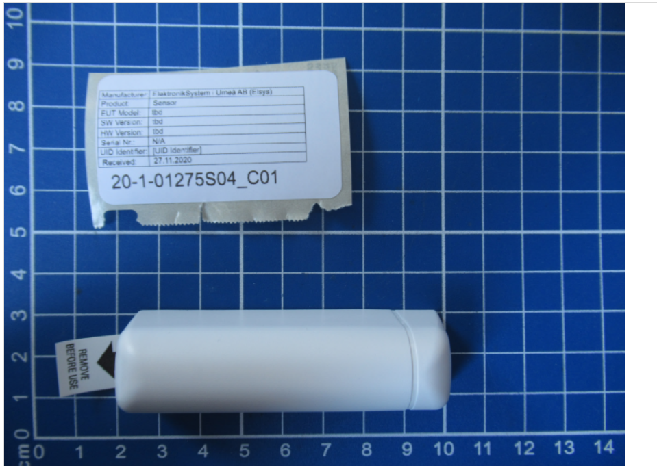
Photograph 1: EUT 1_Top view