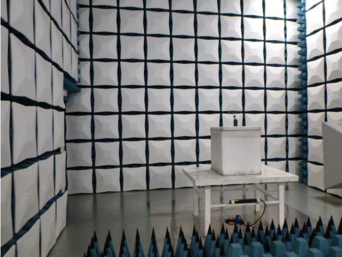
Transmitter Radiated Spurious Emission: