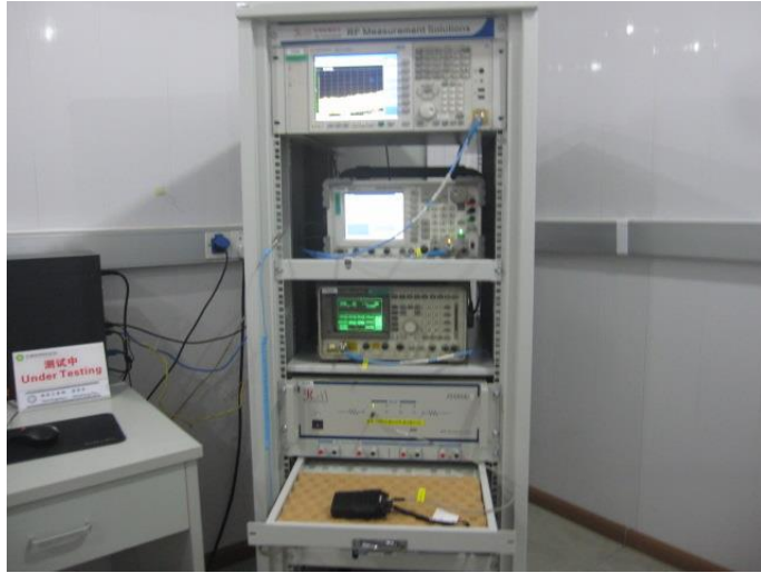
Conducted emission (AC port)