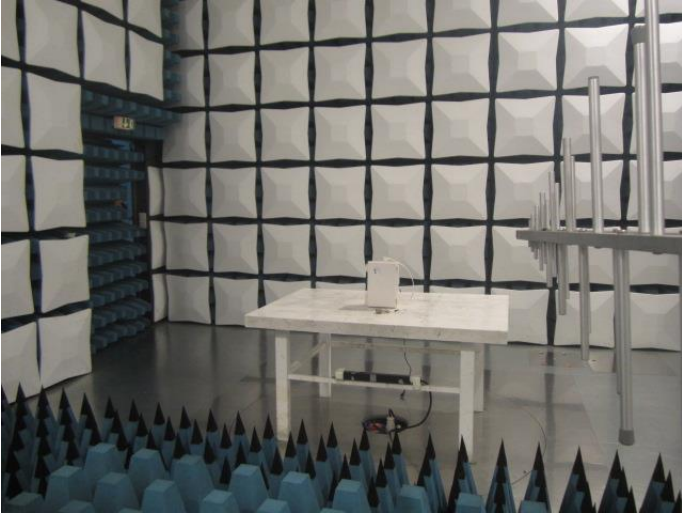
Transmitter Radiated Spurious Emission: