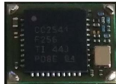
BLE Module without Shield