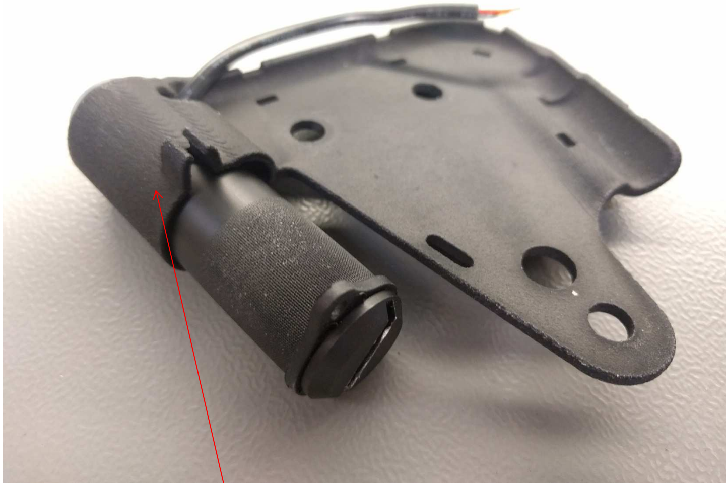
Battery Board External