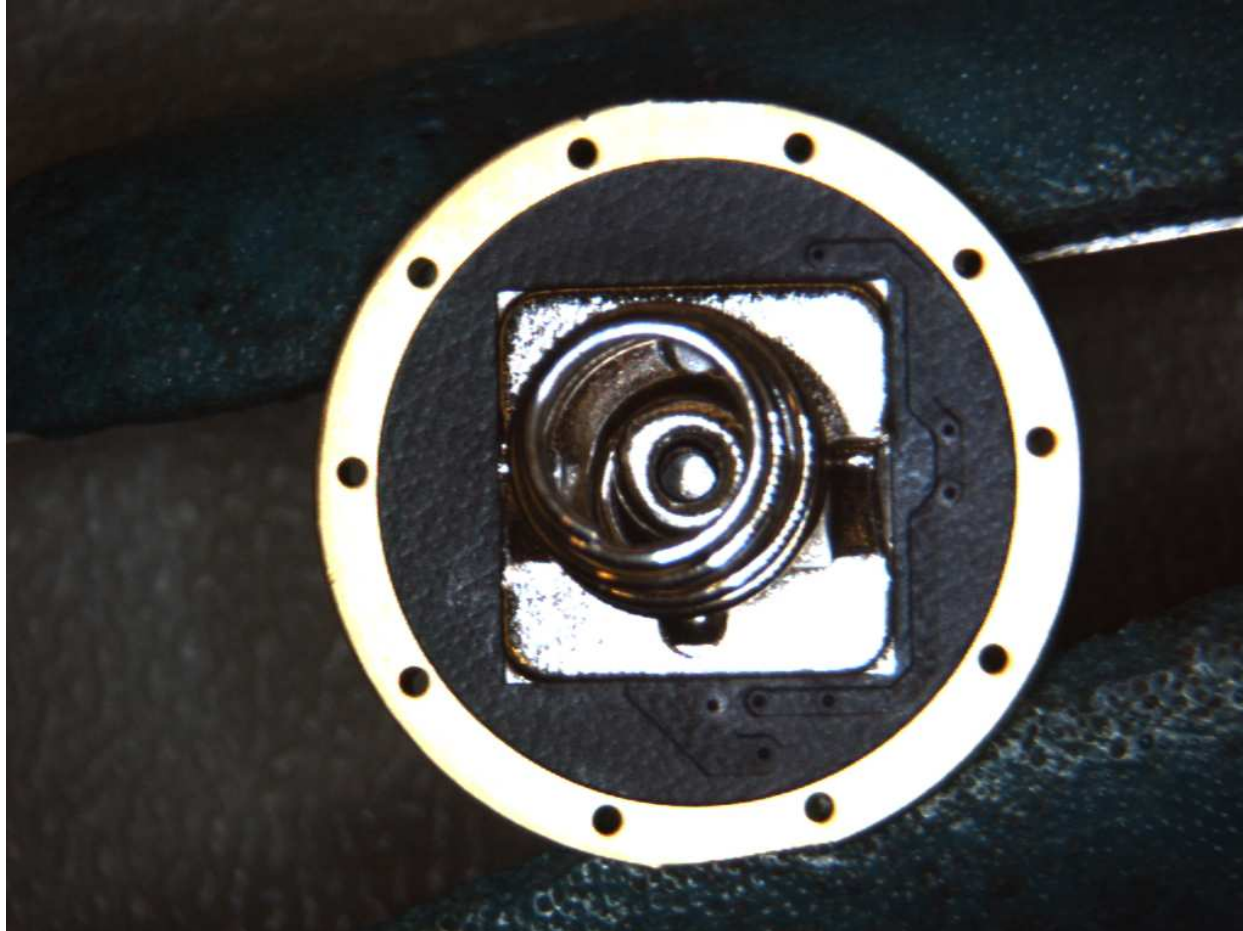
Battery Board BOTTOM