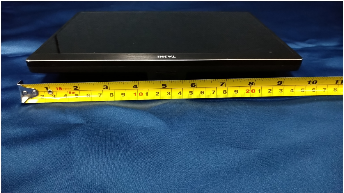
EUT – Rear View