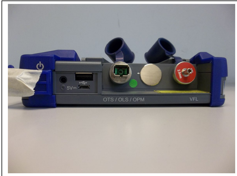
Model TS100-60B-A, cont'd

Applicant: AFL Test and Inspection FCC ID: 2ANTH-FS2TS1