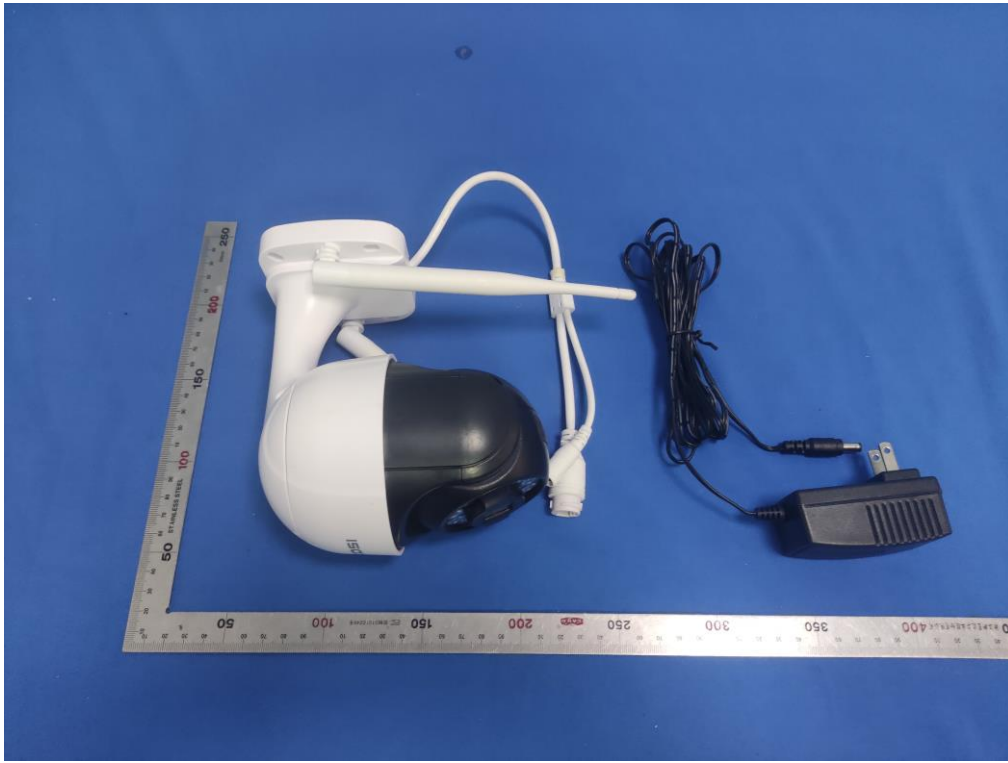
EXTERNAL VIEW-1 OF EUT