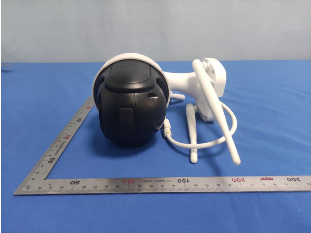
EXTERNAL VIEW-5 OF EUT