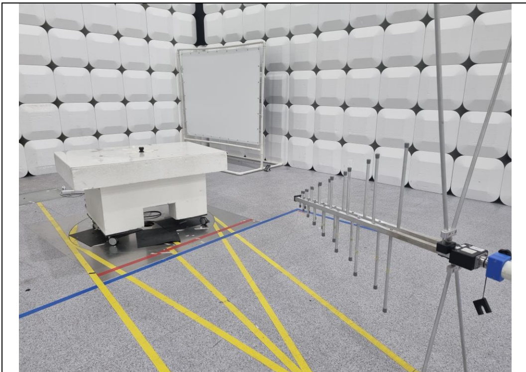
Test distance : 3 m, height of table : 0.8 m