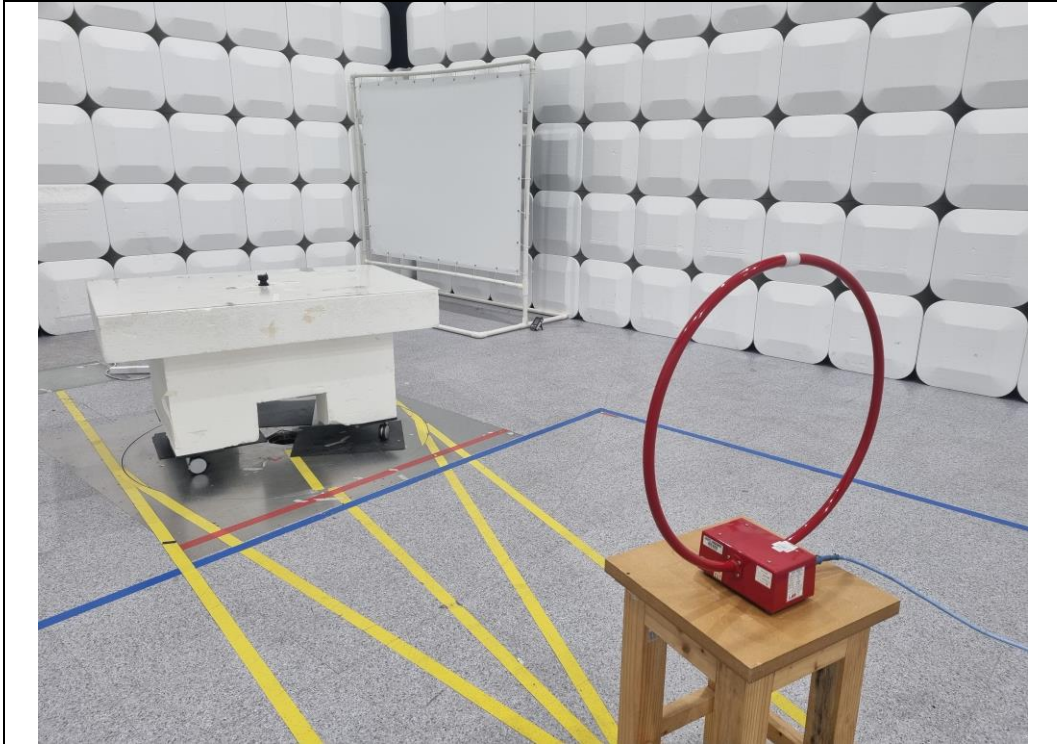
Test distance : 3 m, height of table : 0.8 m