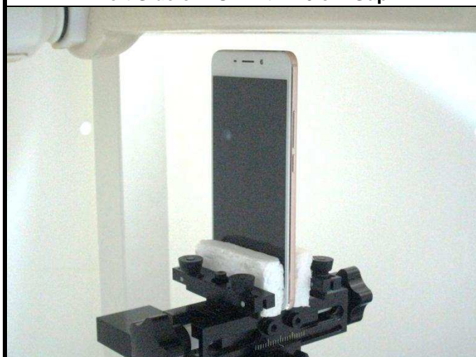
Top Side of EUT with 1.0 cm Gap