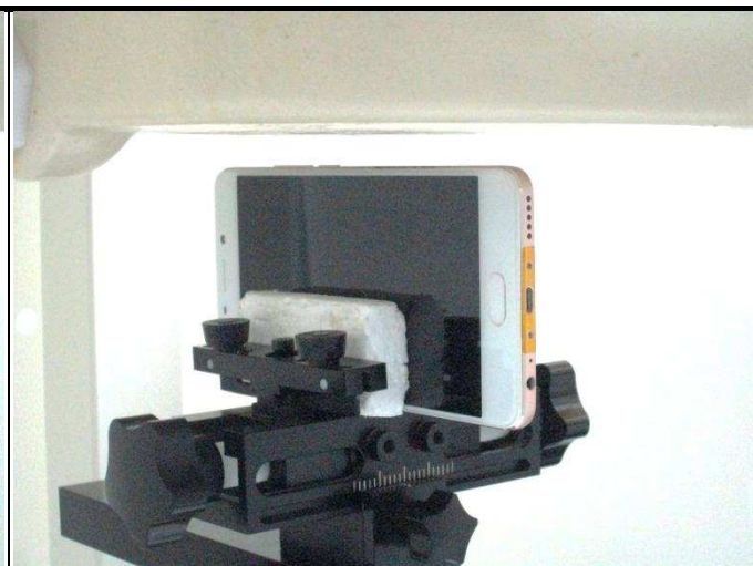
Right Side of EUT with 1.0 cm Gap