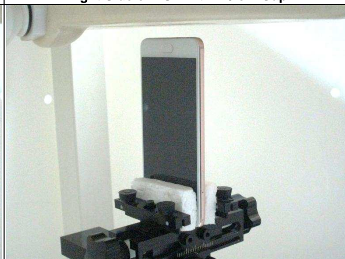
Bottom Side of EUT with 1.0 cm Gap