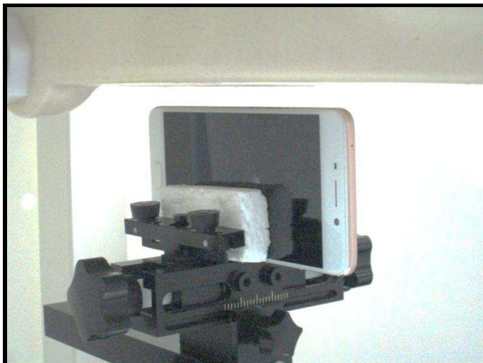
Left Side of EUT with 1.0 cm Gap