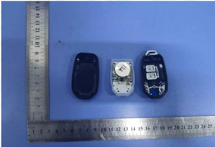
Photo 8 Appearance of PCB