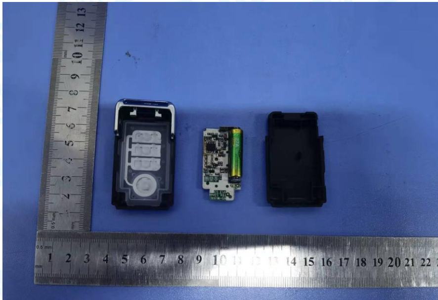
Photo 8 Appearance of PCB