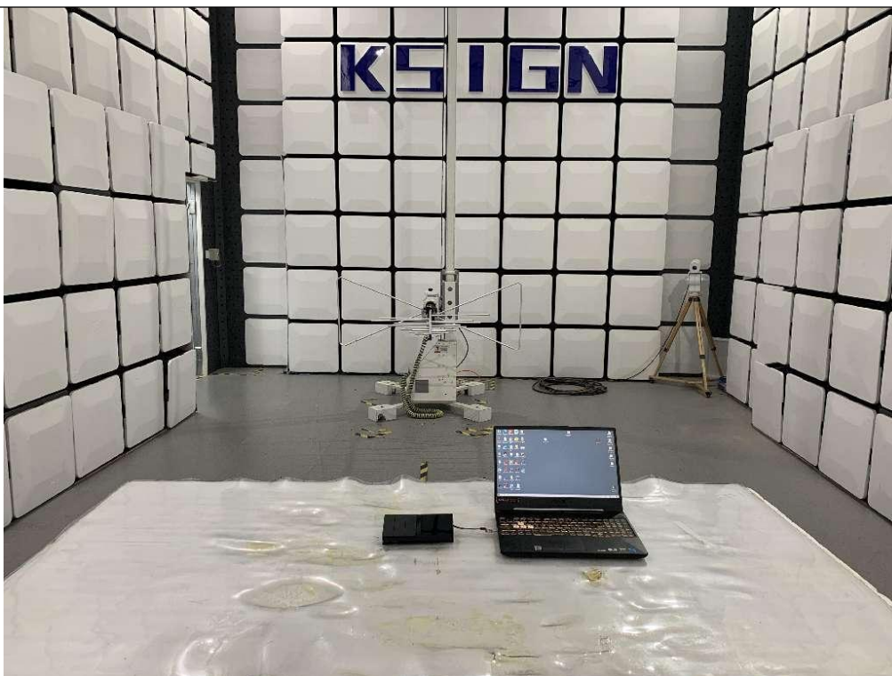
Radiated Measurement (Above 1GHz)