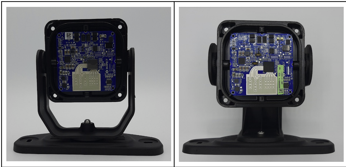
Figure 1: front view without cover with 2-axis rotating stirrup (on the left) and 3-axis rotation stirrup (on the right)