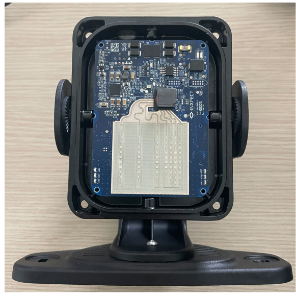
Figure 1: front view without cover with 2-axis rotating stirrup (on the left) and 3-axis rotation stirrup (on the right)