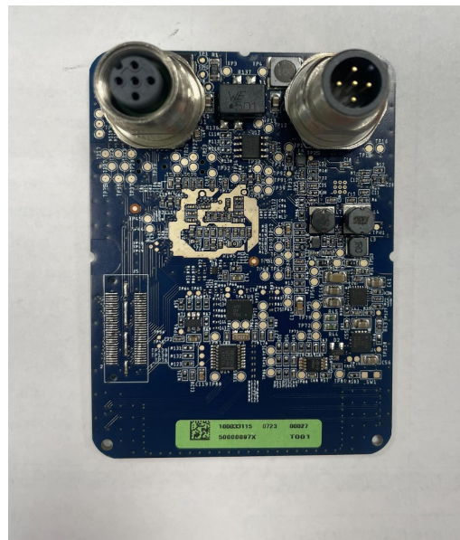
figure 2: top view (on the left) and bottom view (on the right) of the PCB