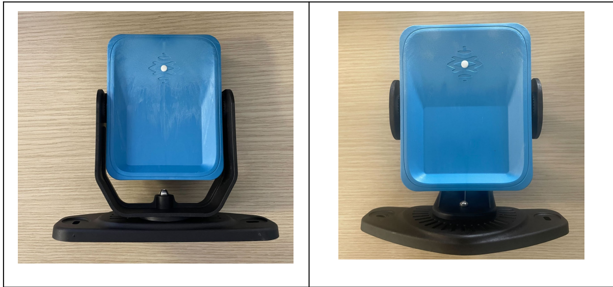
Figure 1: Front view with 2-axis rotating stirrup (on the left) and 3-axis rotation stirrup (on the right)