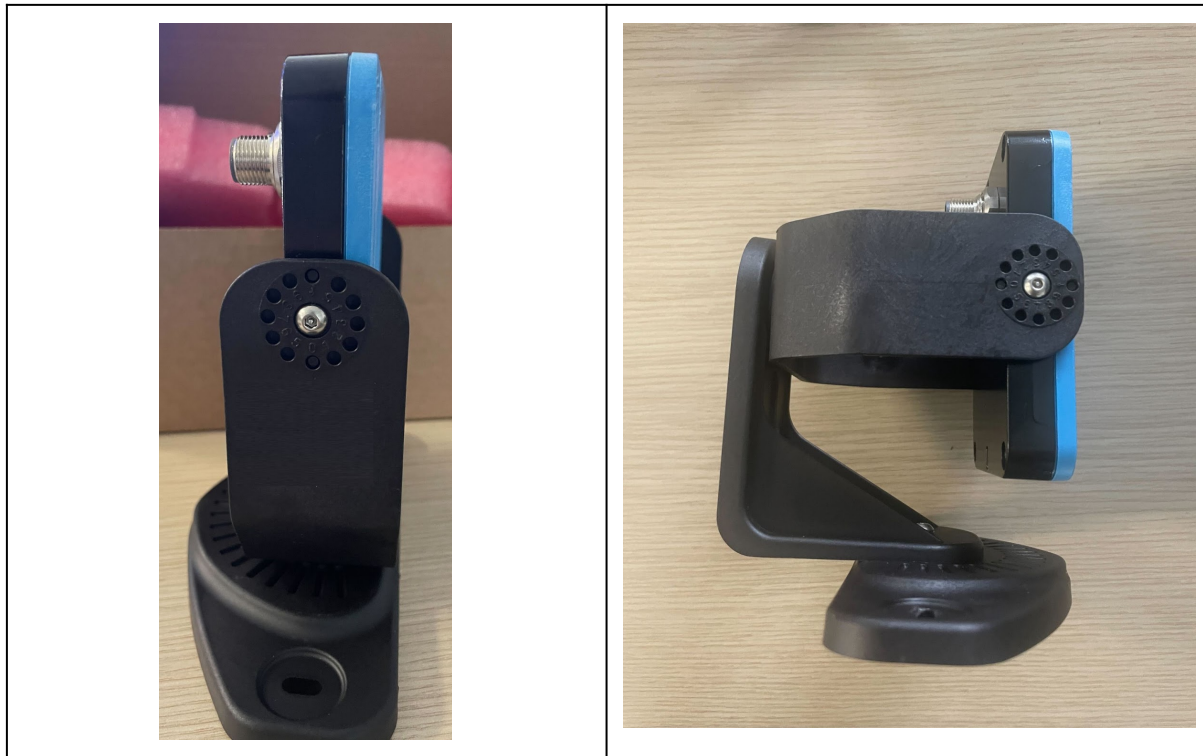
Figure 3: First side view with 2-axis rotating stirrup (on the left) and 3-axis rotation stirrup (on the right)