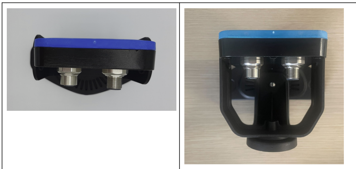
Figure 4: Top view with 2-axis rotating stirrup (on the left) and 3-axis rotation stirrup (on the right)