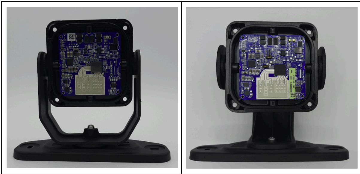
Figure 1: front view without cover with 2-axis rotating stirrup (on the left) and 3-axis rotation stirrup (on the right)