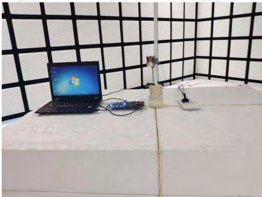
Radiated spurious emission Test Setup-2(Above 1GHz)