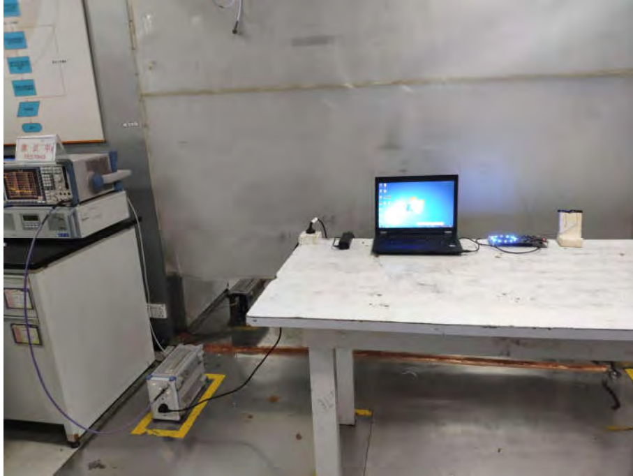
Conducted Emissions Test Setup