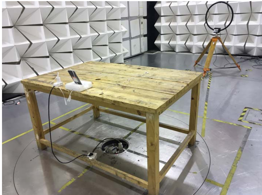
Below 30MHz Test Site 2#