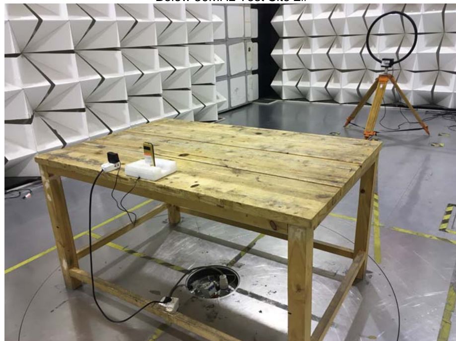
Below 30MHz Test Site 2#

Photograph - Spurious Emissions Radiated Test Setup