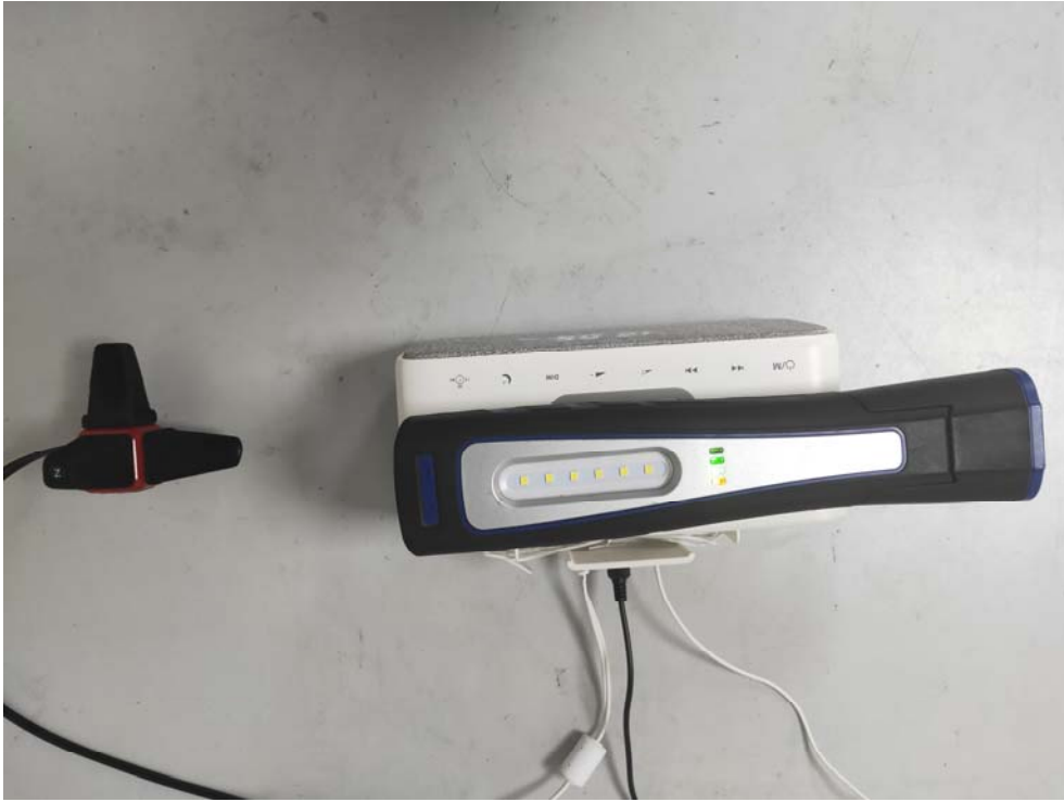
Position B: 15 cm