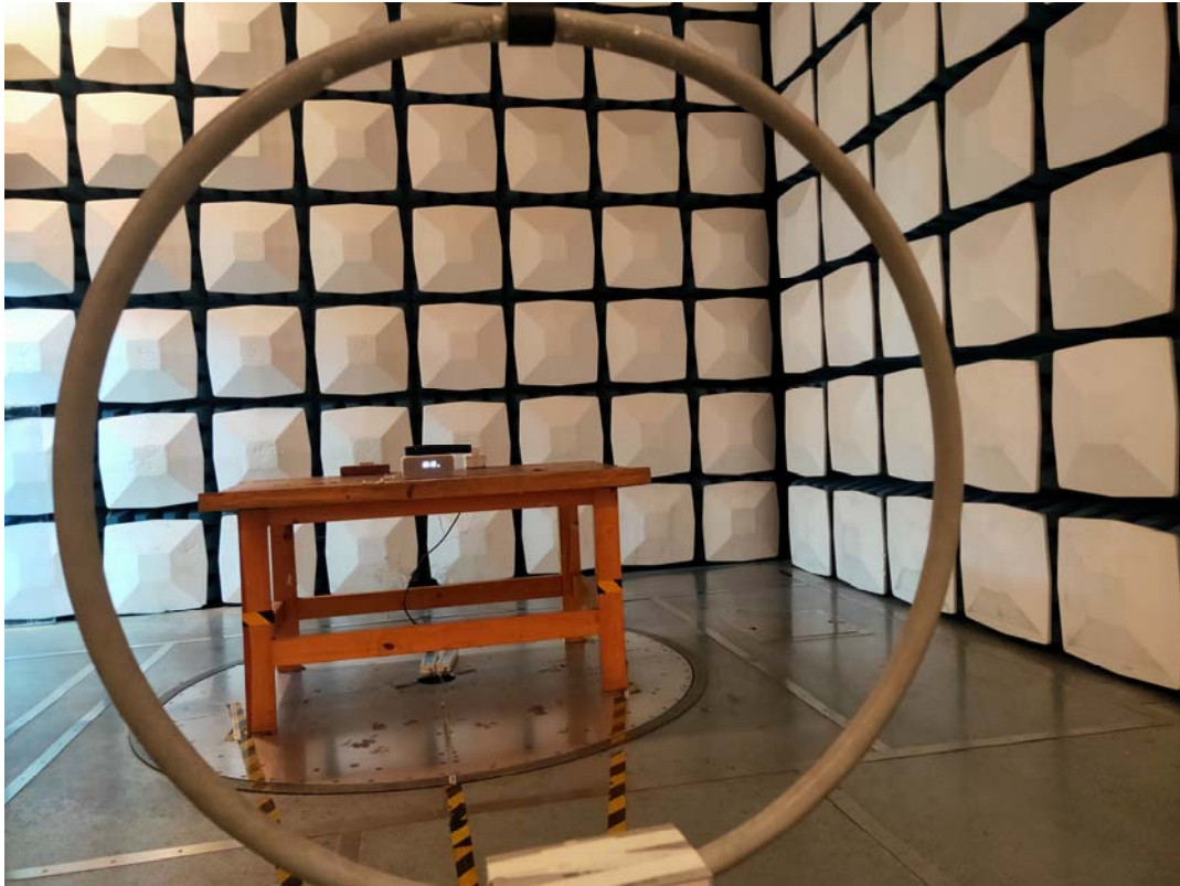
Radiated Emission Below 1GHz View