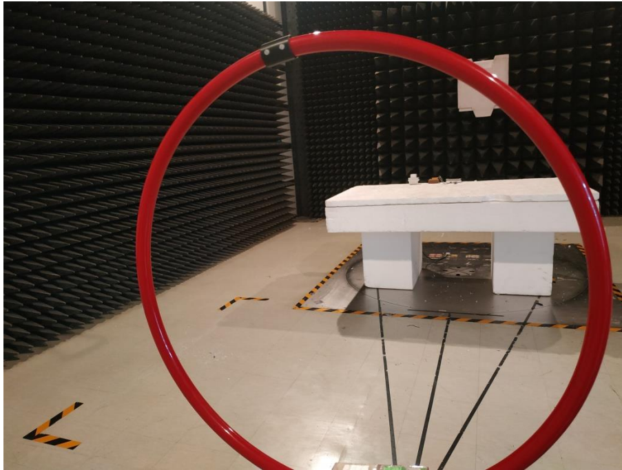
Radiated Emissions View (Above 30MHz)