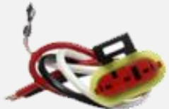
Bare wires to Fit (LA16111)