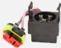
Male PL3 to Fit (LA18021)