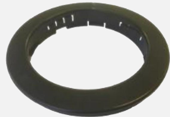
Perma-Lok retaining ring