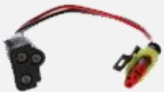
Offset female PL3 to Fit (LA17011)

TrackLight connects to the vehicle's standard wiring lead using a Fit N Forget connector. If your vehicle uses an earlier PL-3 connector, Anytrek offers adaptor cables that removes the need to cut the existing wiring leads.