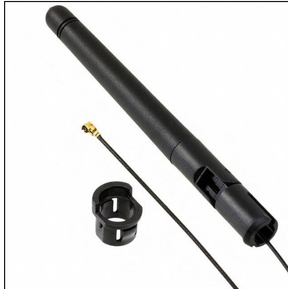
Figure 3: Whip Antenna