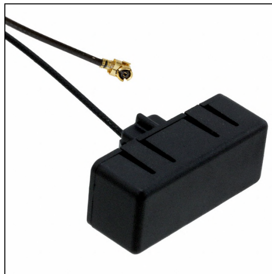
Figure 4: Module Antenna