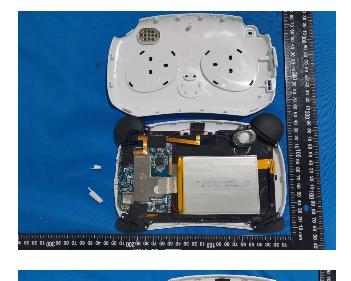
EXHIBIT C - EUT INTERNAL PHOTOGRAPHS