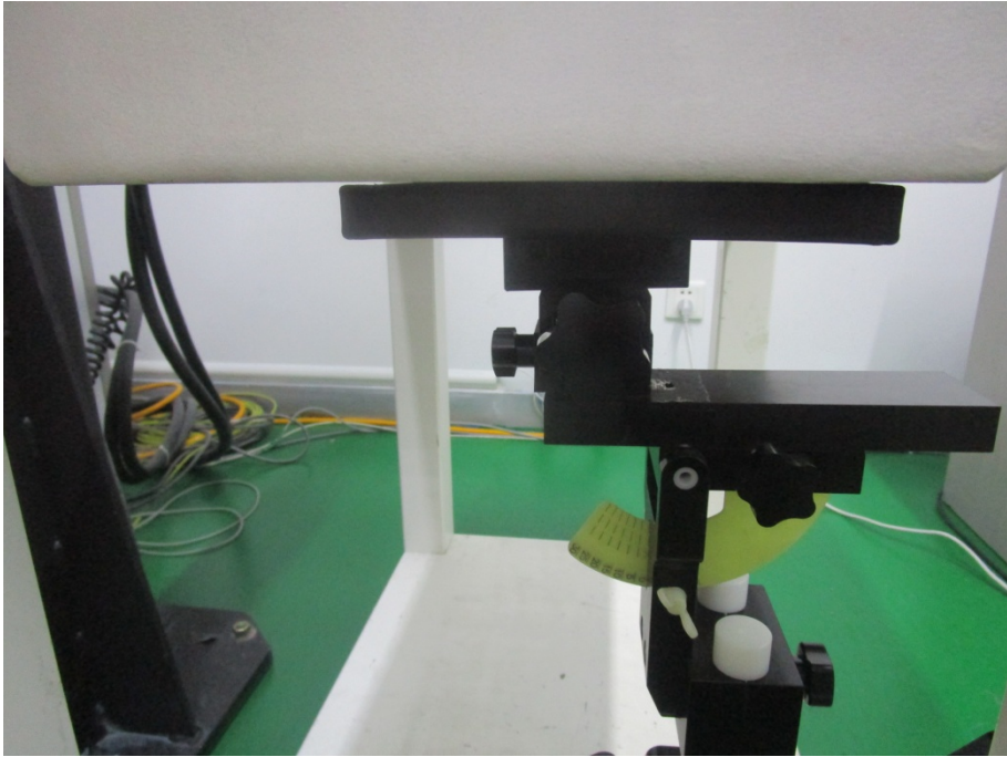
Body Left Setup Photo(0mm)