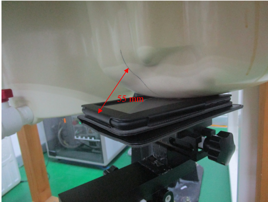
Head Flat Setup Photo