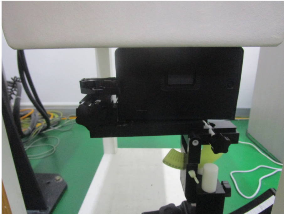
Body Bottom Setup Photo(0mm)