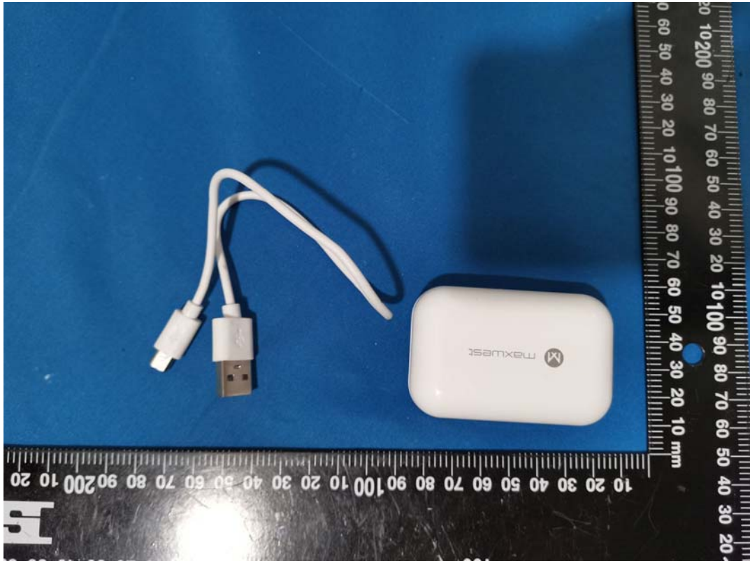
EXHIBIT B - EUT EXTERNAL PHOTOGRAPHS