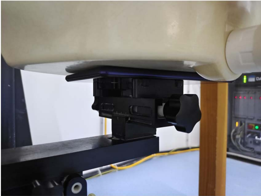
Body Left Setup Photo (0mm)