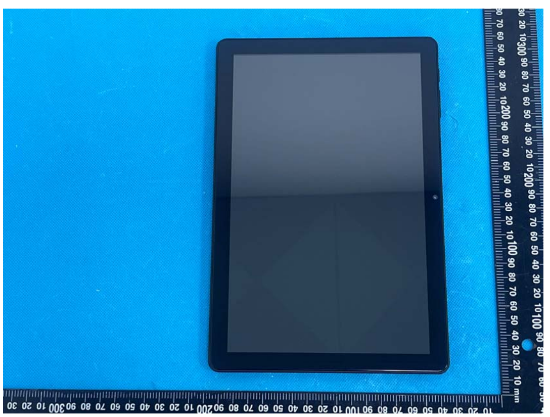
Page 1 of 5