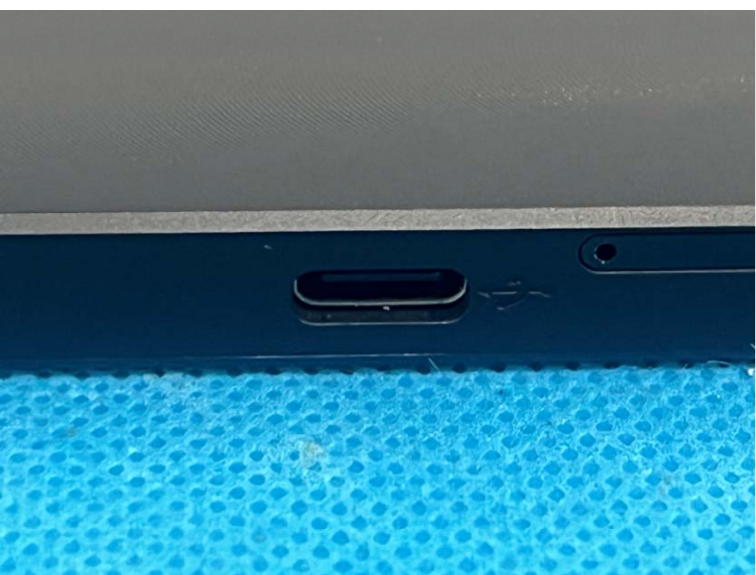
Page 4 of 5