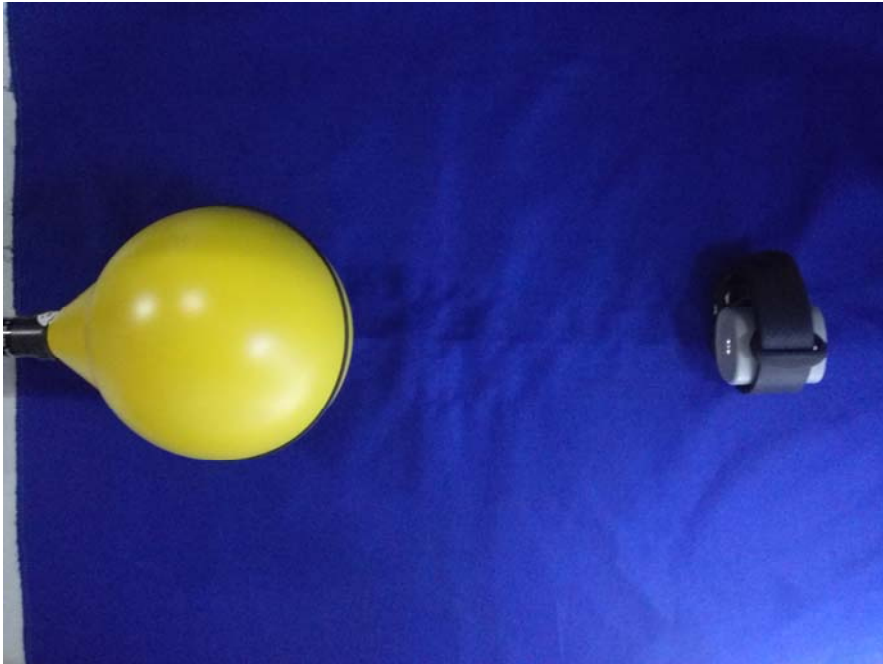
H-Filed Strength View