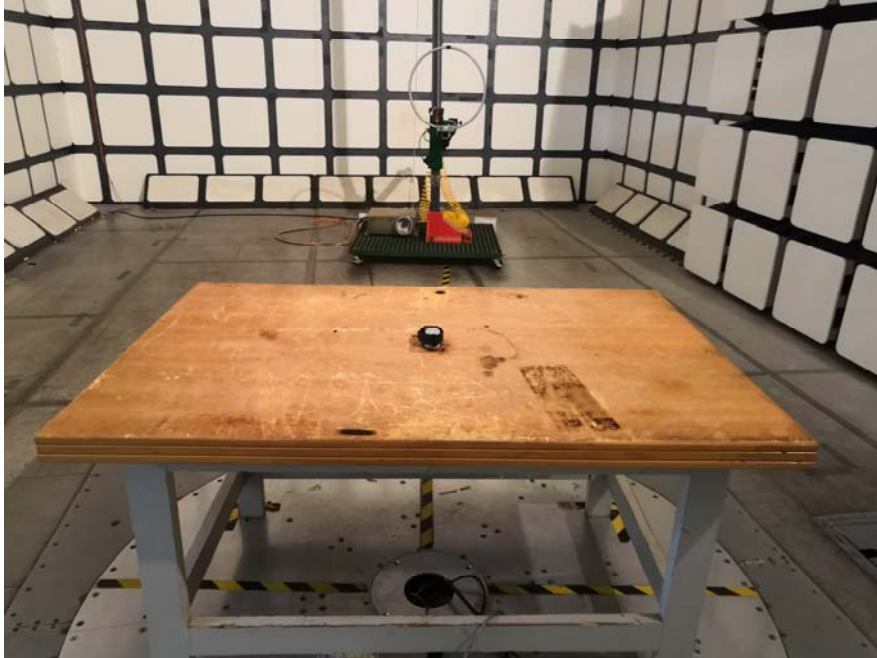
Radiated Emissions View (30 MHz ~ 1 GHz)