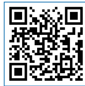
Scan QR Code and Download

Scan the following QR code, download and install the App.