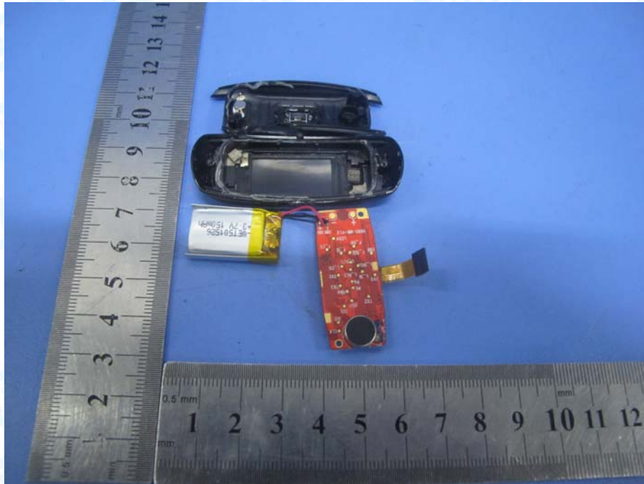
Photo 9 Internal of EUT