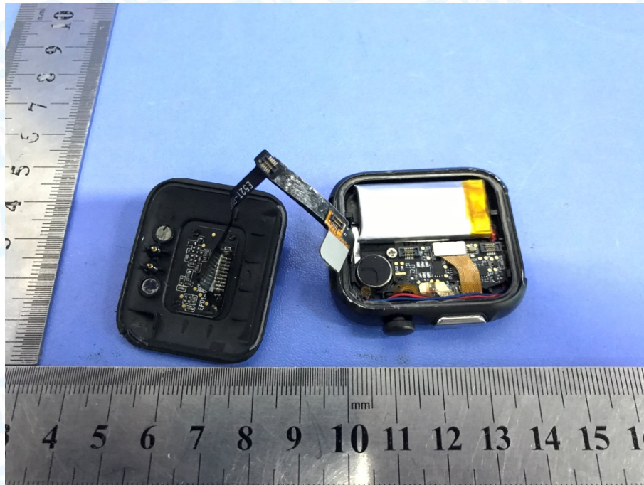
Photo 7 Internal of EUT