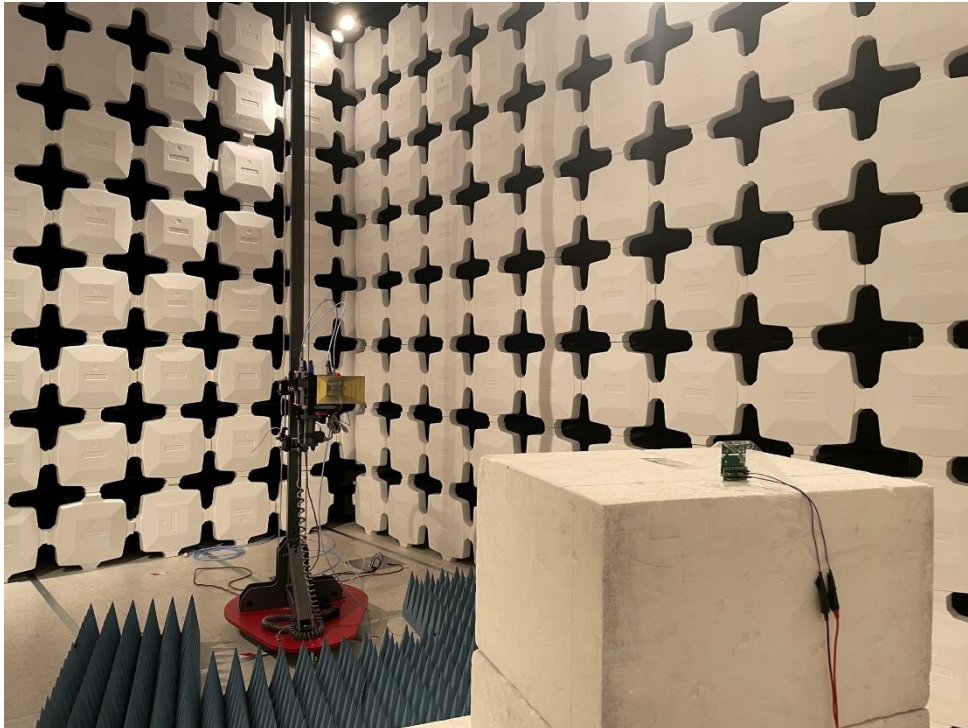
Above 18 GHz