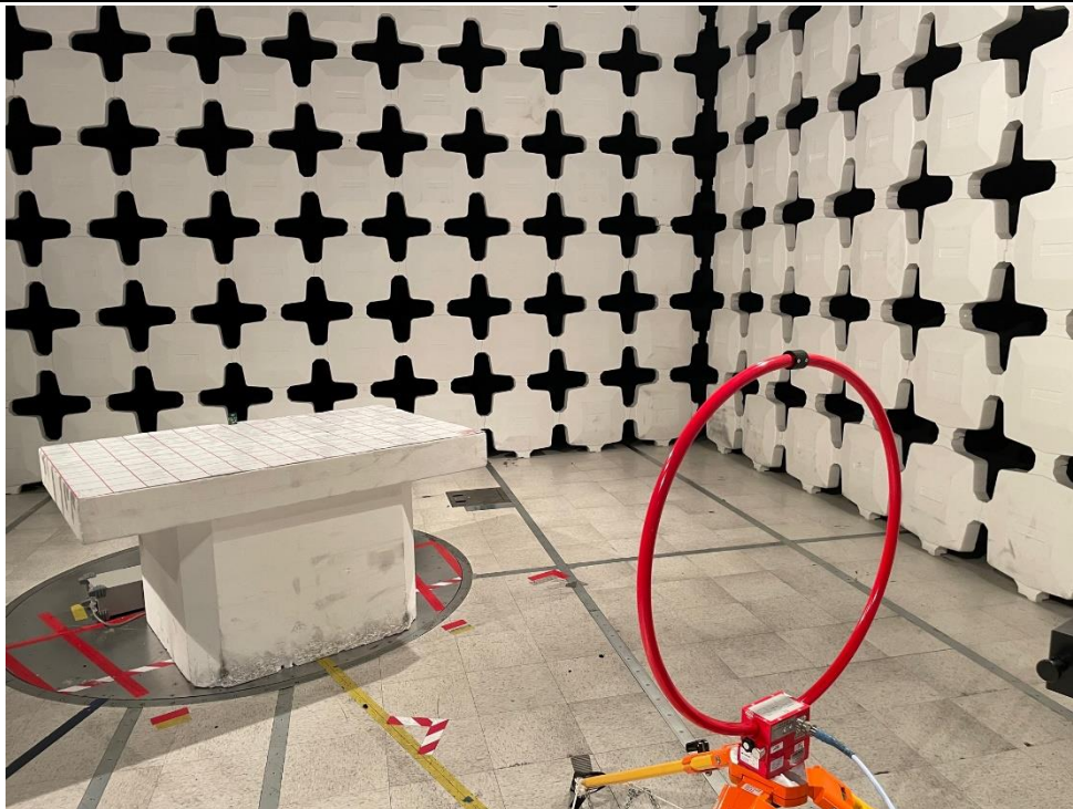
30 MHz – 1 GHz