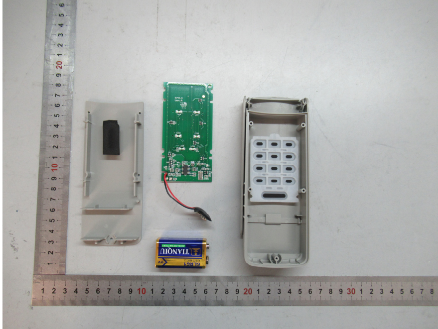
EUT – Battery Top View