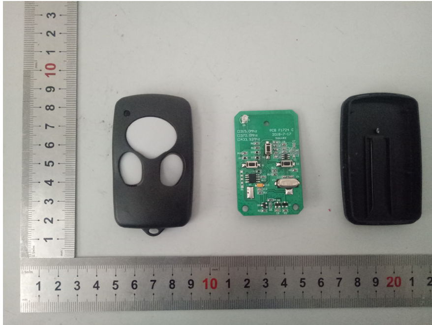
EUT – Cover off View-2