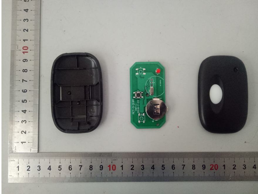
EUT – Cover off View-2