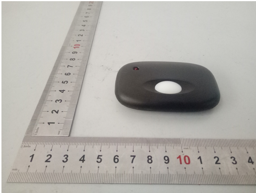
EUT – Rear View