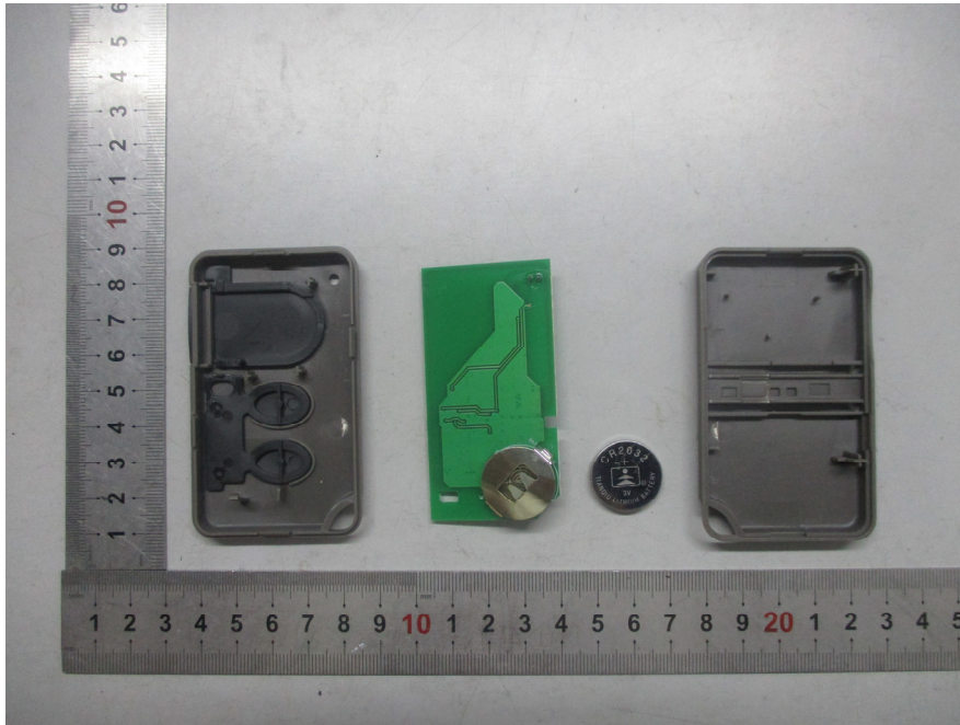
EUT – Battery View