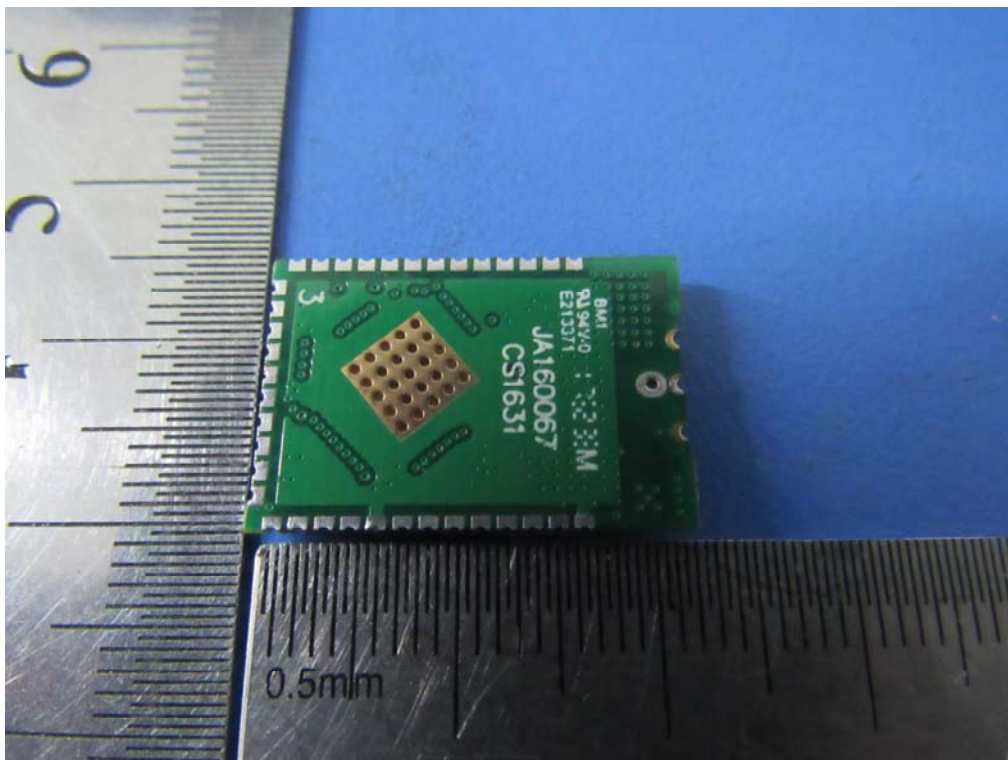
EUT PCBA 1 – Rear View